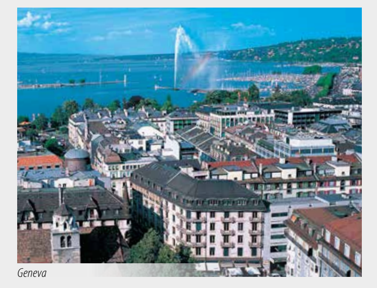
For additional nights in Zurich and/or Geneva see page 11